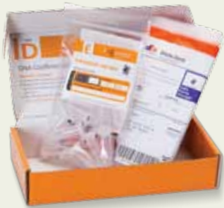
Pathology Lab Components

If the biopsy results come back positive for cancer (malignant), the DNA lab performs a DNA Specimen Provenance Assignment (DSPA) test to compare the DNA profiles of the biopsy tissue and the reference sample. Concurrence of these profiles allows for absolute confirmation of patient identity.