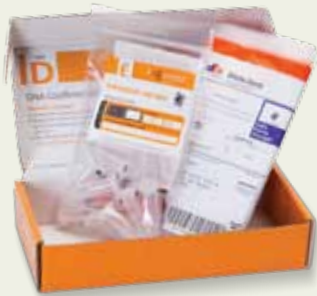
Pathology Lab Components

If the biopsy results come back positive for cancer (malignant), the DNA lab performs a DNA Specimen Provenance Assignment (DSPA) test to compare the DNA profiles of the biopsy tissue and the reference sample. Concurrence of these profiles allows for absolute confirmation of patient identity.